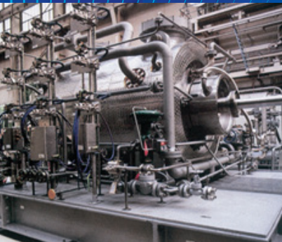
High Speed Motors & Compressors