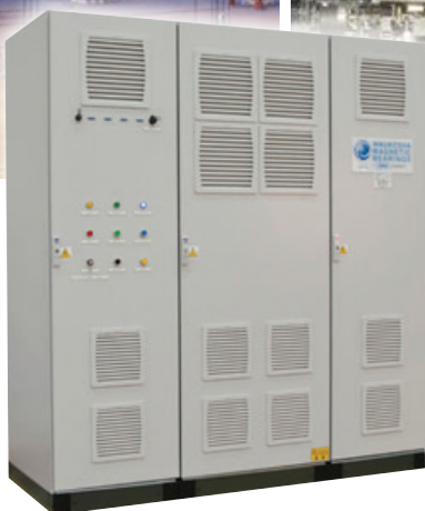
800(D) x 2000(W) x 2100(H) mm