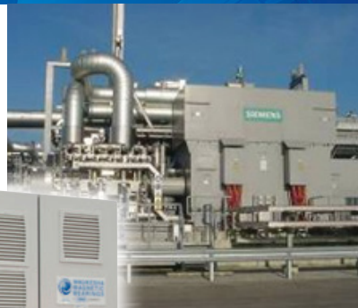
Electric Motors & Compressors