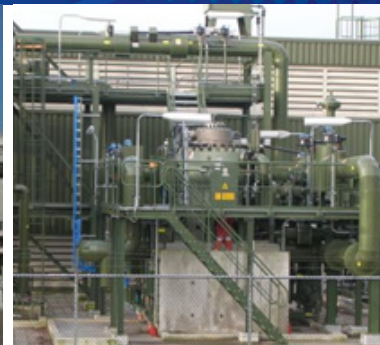
Hermetically Sealed Motor-Compressors