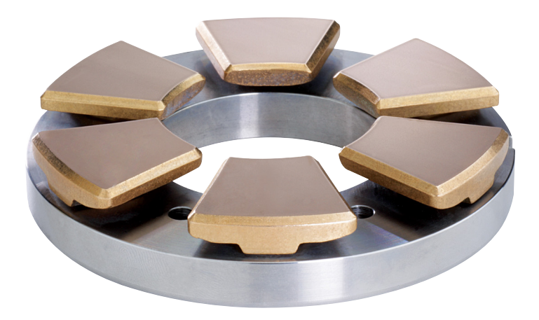
Bronze Deflection Pad<sup>®</sup> bearing. Bronze bearings can be monolithic cast or tilt pad designs, including Flexure Pivot<sup>®</sup> tilt pad bearings.

Being a metallic material like babbitt, AISn allows existing protocols (thermo-sensors) to be used for monitoring bearing health. And, like babbitt, AISn can be applied to either steel or CuCr backing – the former for copper-free applications, the latter to suit high speed, high load capacity designs. AISn bearings can also increase safety margin in case of an unexpected upset condition such as accidental overload.