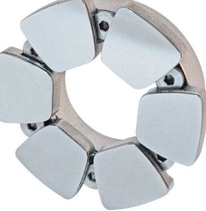
Hidrax<sup>™</sup> HT cermet tilt pad thrust bearing for electric submersible pump.